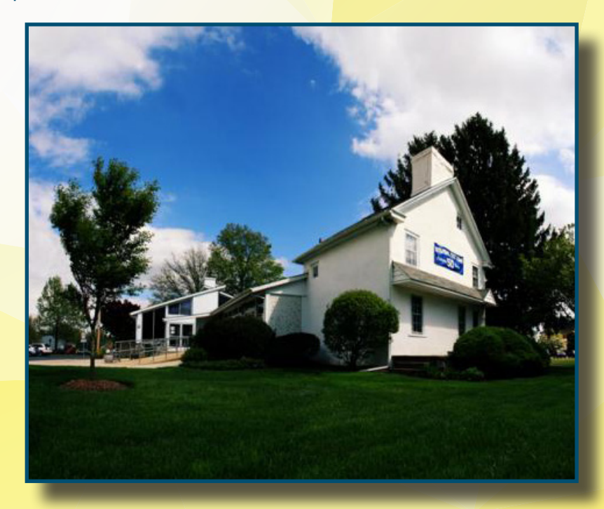
Weathers' Homestead - circa 1819, plus 1962 and 1971 Expansions